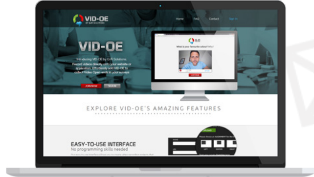
VID-OE Recording Software

Q-FI Solutions was founded in 2011 by a team with in-depth knowledge of the Market Research industry.